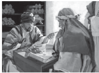
The unjust steward

this parable, but I think a clue to its interpretation lies in noticing that its central message seems to be about not squandering one's resources, even if those resources be worldly. What impresses the rich man in this parable is the steward's entrepreneurialism, not his dishonesty. But securing our earthly position through such means is a far cry from achieving heavenly rewards, and Oliver James probes this deep dis-ease in this book. So perhaps affluenza is a timely reminder of: 'for what shall it profit a man, if he shall gain the whole world, and lose his own soul?' (Mark 8:36).