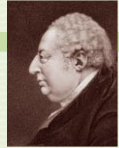
3rd Duke of Bridgewater