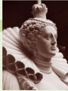
Queen Elizabeth I